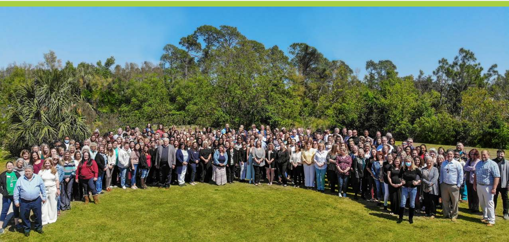
2021 PanCare Staff Photo

Serving Bay, Calhoun, Franklin, Gadsden, Gulf, Holmes, Jackson, Liberty, Walton & Washington Counties