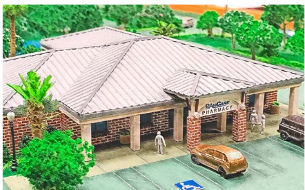
Pharmacy & Optometry

This project will cost approximately 30 million dollars. Seeking funding sources to make this Healthcare Center an expedient funding approval, we hope to have the